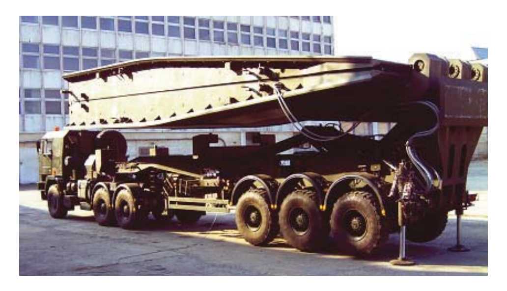
Fig. 2. MS20 bridge set in the beginning stage of unfolding