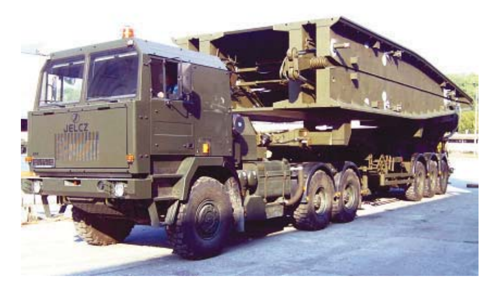
Fig. 1. MS20 bridge set

In theory, only one operator is sufficient to unfold the bridge. Optimum number of operating personnel -3 men.