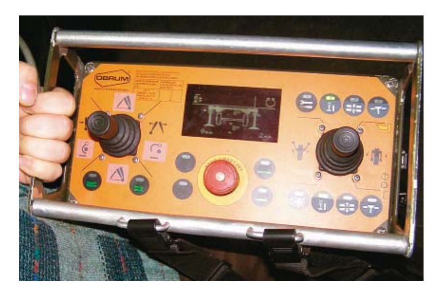
Fig. 15. Portable panel

The control system enables operating the set in automatic and manual mode, controls levelling the system as well as other elements that influence safety, such as hooks coupling, pressure, position of executive elements. Operations are performed by one operator standing next to the set. The operator is equipped with portable panel connected with the semitrailer with a cable. Using the panel, the operator can perform and supervise all activities from levelling to unfolding the bridge, disengaging the hooks and folding the layer.