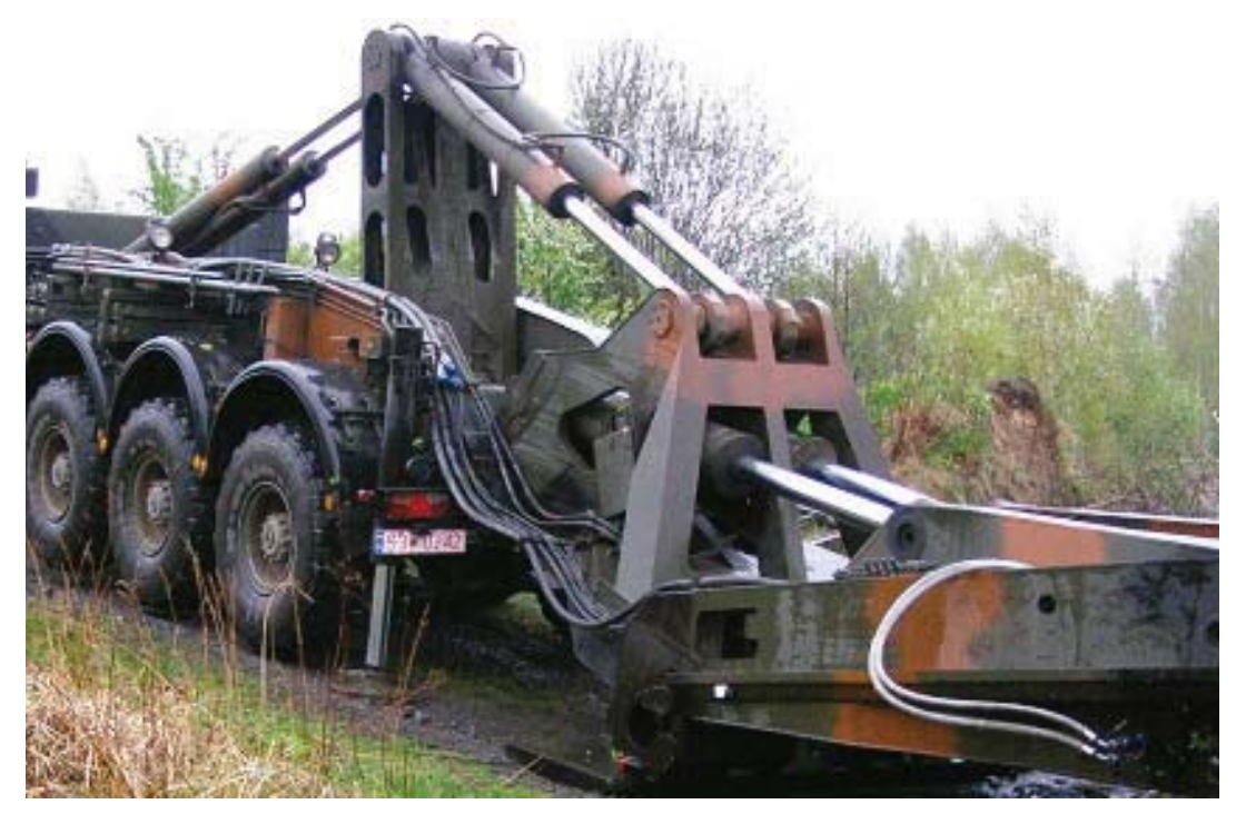
Fig. 10. Layer in unfolded position