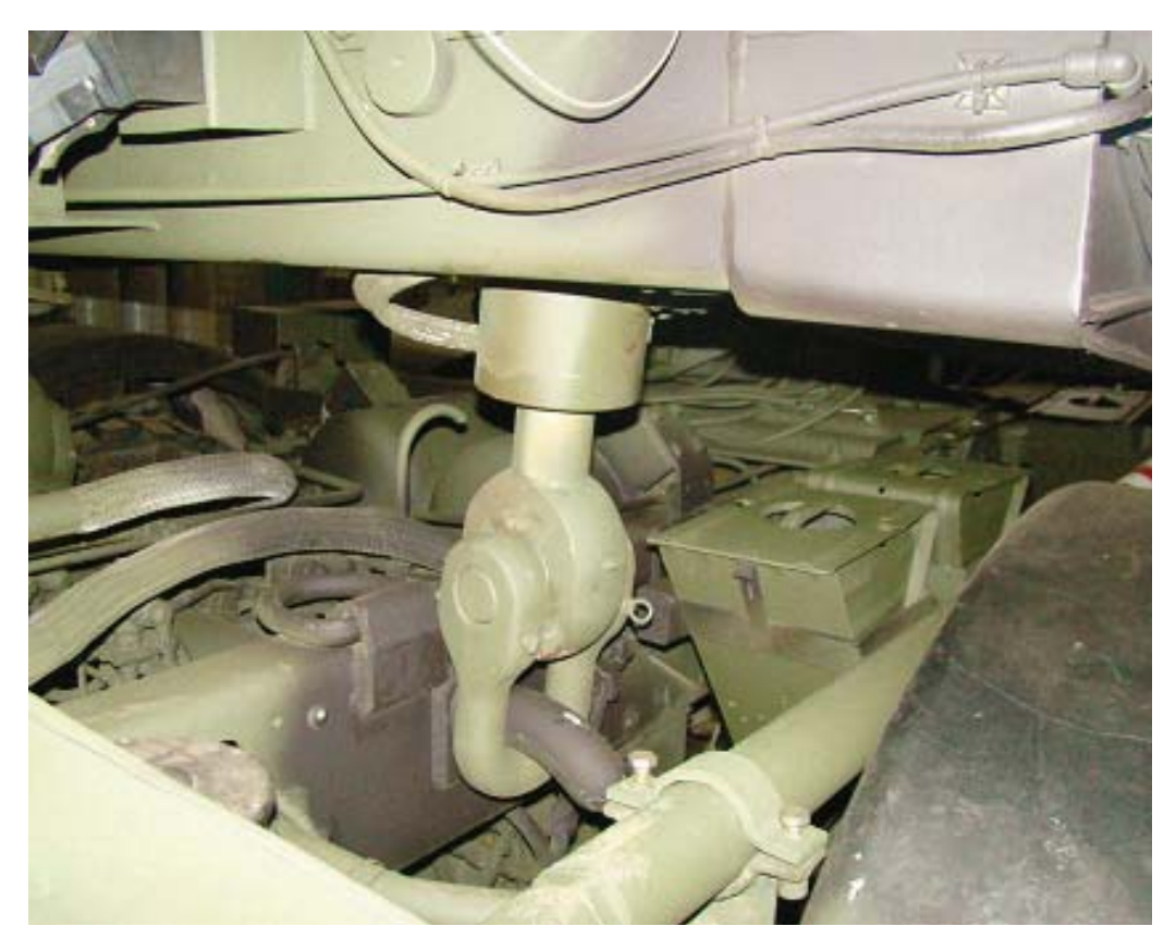
Fig. 12. Coupling mechanism