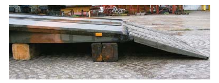
Fig. 7. Part of the span with approach ramps