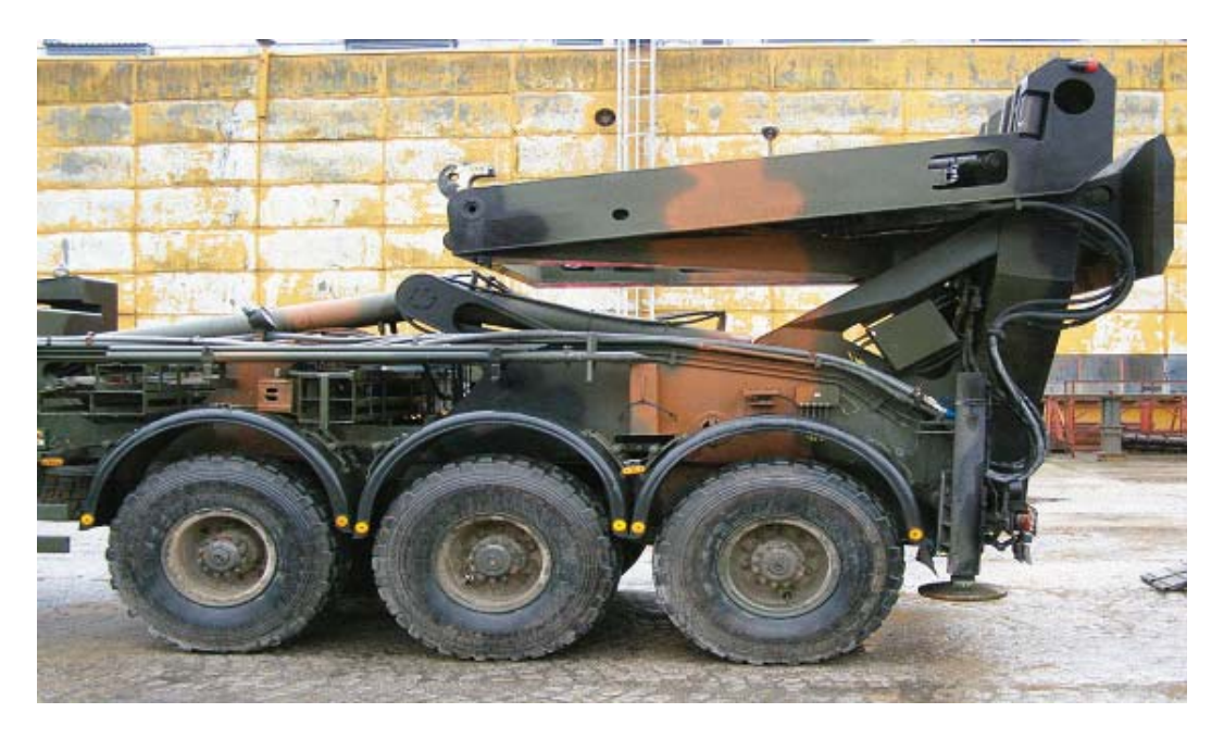
Fig. 11. View of the layer in folded position