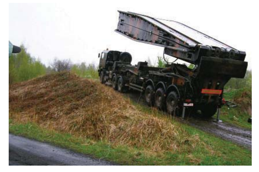
Fig. 18. Unfolding the bridge at inclination 20%