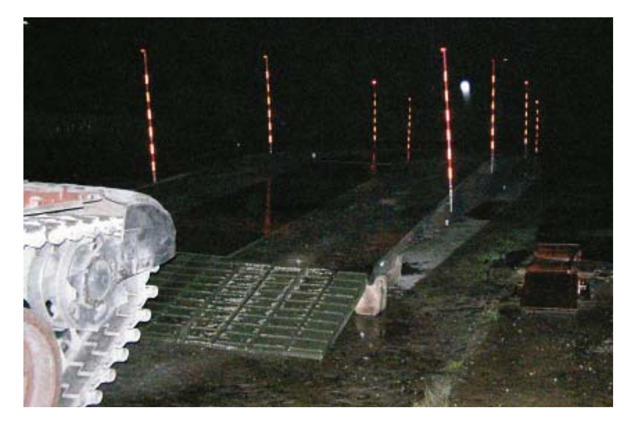
Fig. 9. Span at night