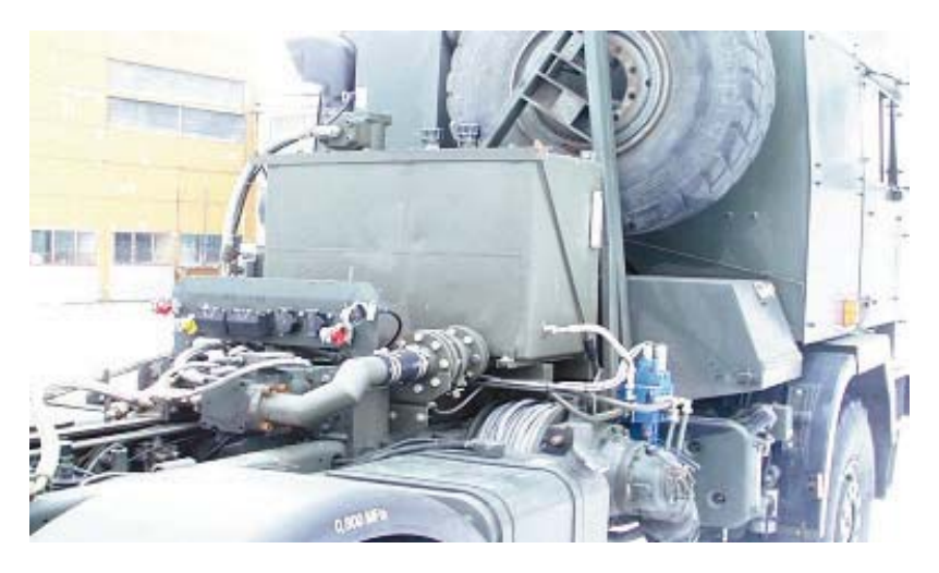
Fig. 4. Jelcz C662D43 truck-tractor - rear view