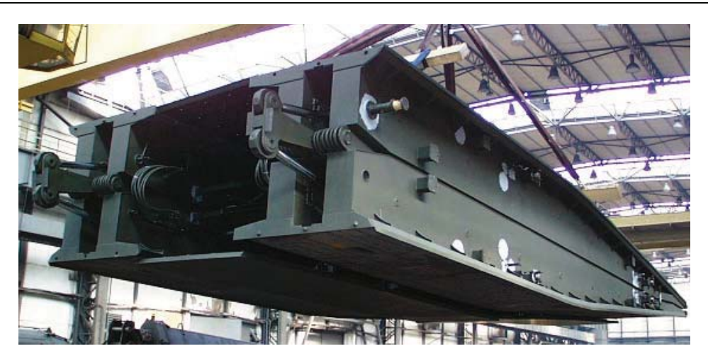
Fig. 5. Folded span