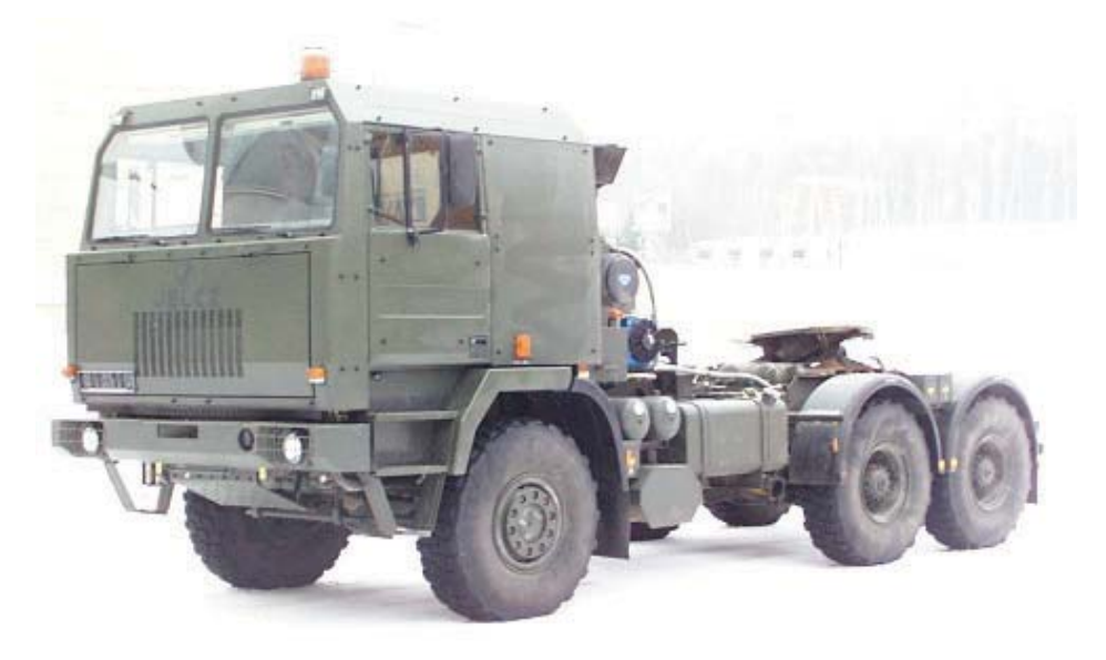
Fig. 3. Jelcz C662D43 truck-tractor

The truck-tractor frame is equipped with catches for coupling the truck-tractor with semitrailer during handling the span. Height of the fifth wheel coupling (1600 mm) as well as diameter of the pin (2") is typical and enable using the truck-tractor for transportation of other semitrailers, not only the special bridge semitrailer.