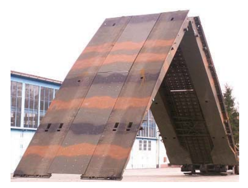
Fig. 8. Span during unfolding