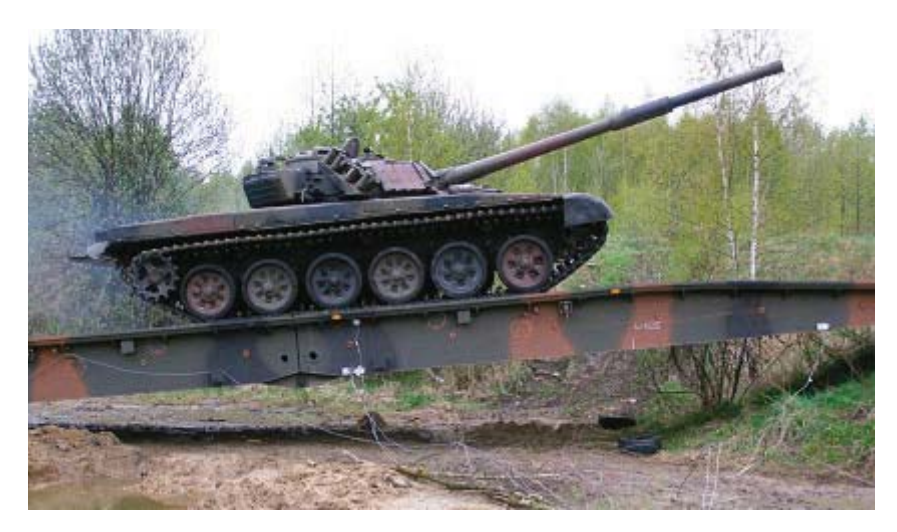
Fig. 17. Tank passing dry pit